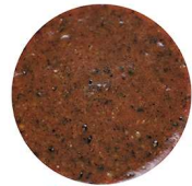
Honey Sesame Miso