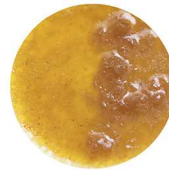
Soy Onion Garlic