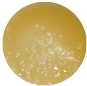
Soy Sesame Oil