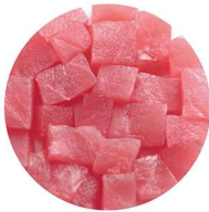
Ahi Tuna [$9.00]