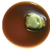
Soy Wasabi & Sesame Oil