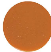
Super Spicy Mayo